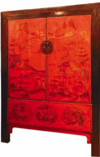
◀ ARMOIRE Available at Turquoise Décor Price: $1,795

This restored lacquered armoire is more than 100 years old. Made of elm wood, it hails from the south of China. “The pictograms on the doors correspond to the region from which the armoire originates,” Tracey says.